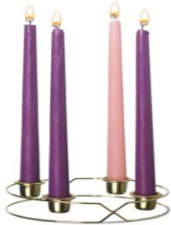
(The Advent Wreath is sold by the Parish for $10.00.)

Perhaps the best-known of all Advent symbols is the Advent wreath , a custom that originated among German Lutherans but was soon adopted by Catholics. Consisting of four candles (three purple or blue and one pink) arranged in a circle with evergreen boughs (and often a fifth, white candle in the center), the Advent wreath corresponds to the four Sundays of Advent. The purple or blue candles represent the penitential nature of the season, while the pink candle calls to mind the respite of Gaudete Sunday. The white candle, when used, represents Christmas.